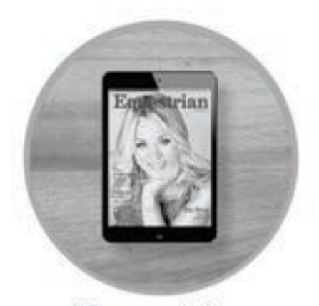
Equestrian The official magazine of the USEF

The national governing body for equestrian sport