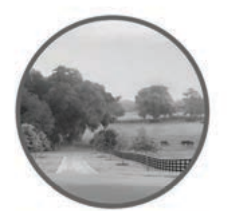
UNITED STATES EQUESTRIAN FEDERATION

The national governing body for equestrian sport